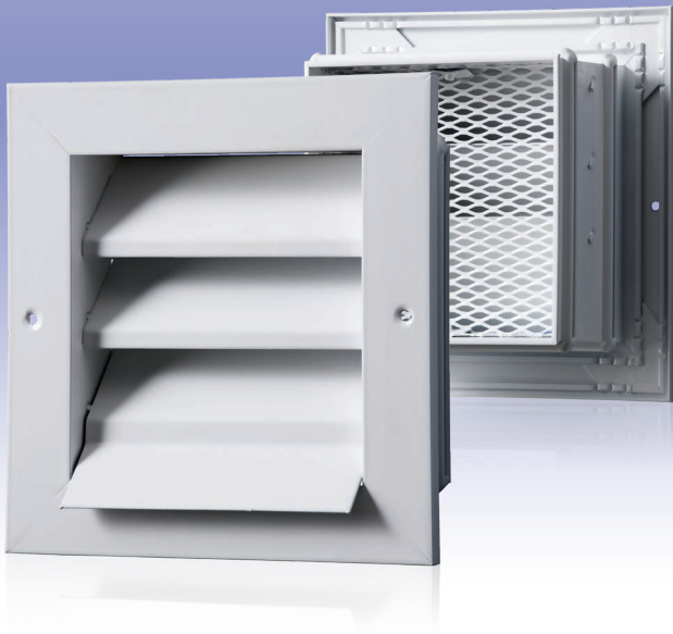
Supply and exhaust ventilation grille with fixed vanes